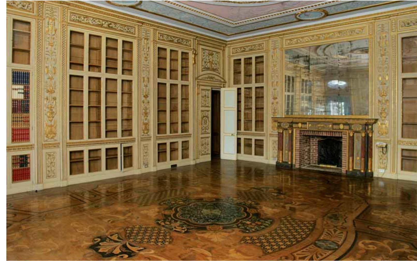
The main front consists in a honor entrance to the primary lounge and to the beautiful frescoed rooms, all of them overlooking the beautiful large terrace with panoramic view.