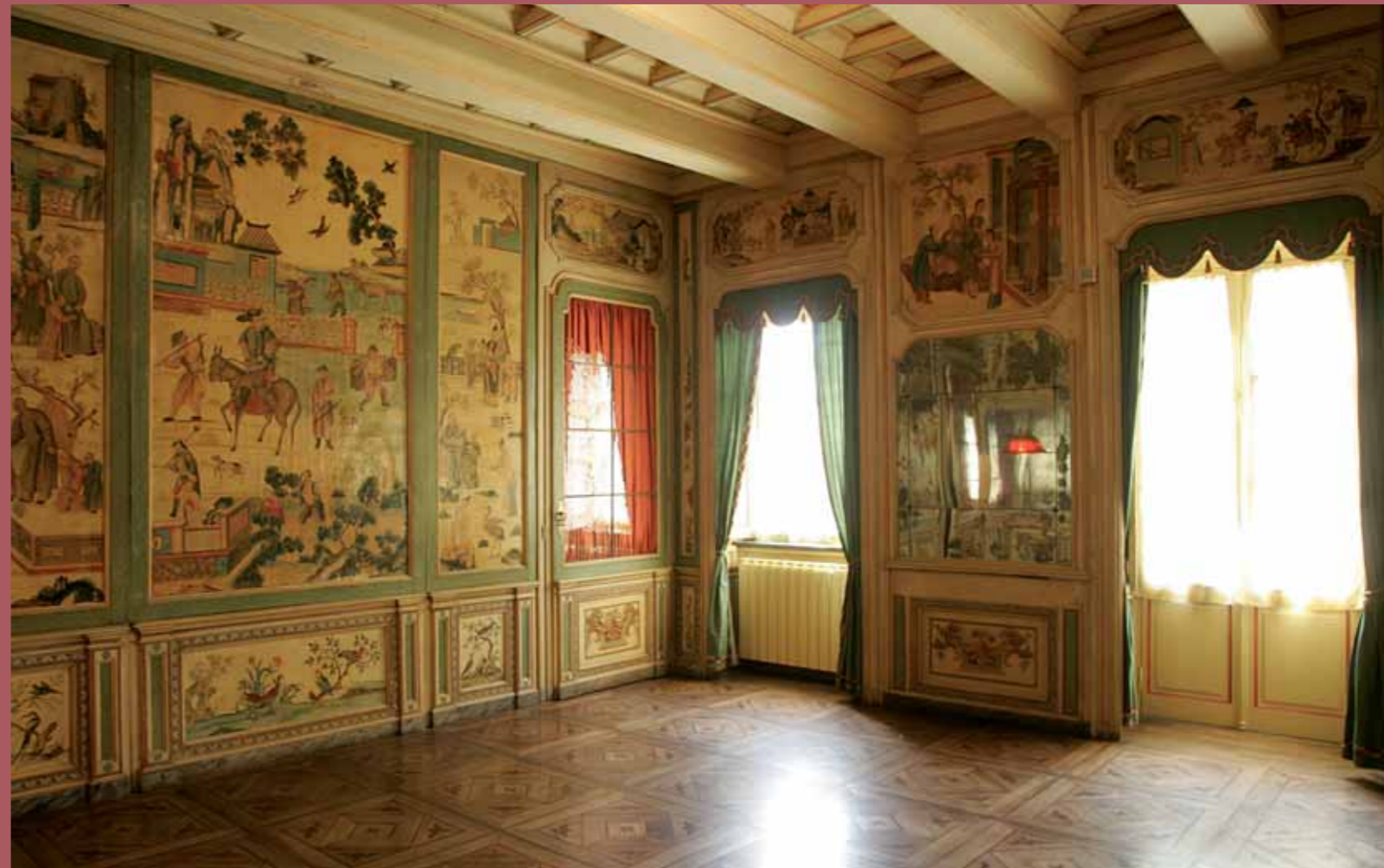
In these marvellous rooms took place several scenes of Valeria Bruni Tedeschi's autobiographical film "It's Easier for a Camel..." Both Carla and Valeria loved the precious and serene time they spent here.