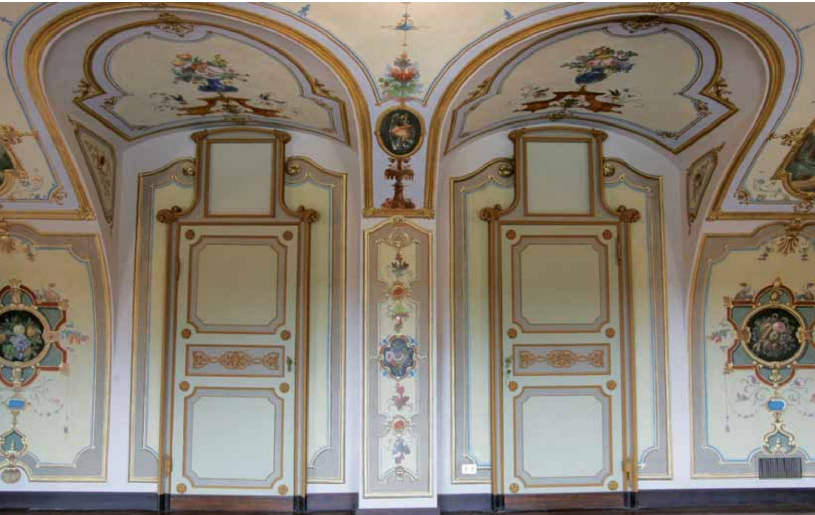
More than 40 rooms are in the property and each of them is a little trip to a glorious past. Several hallway frescoes, majestic fireplaces and elegant tapestries go hand in hand with elevators, fine equipped kitchens and baths, and functional heating systems.